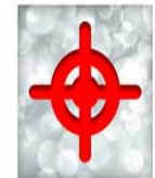
SECURITY AS A SERVICES

We ensure that our customers only invest in the technology they require to operate, communicate and manage their business effectively. For that reason, we encourage organizations to effectively use what they already have and systematically add to it or upgrade it to meet their current and future needs. Your local ITWorks365 office can help you determine what solution is right for you.